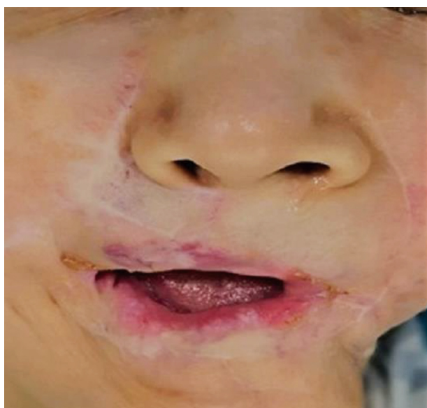
Fig. 2 - Nine months postoperatively.

The lack of any substantial fibrous framework increases the risk of anatomic distortion through wound contraction and, hence, leads to poor functional and esthetic outcomes [2]. The quality of the skin and mucosa of the lips is difficult to match with that of distant flaps; hence, local tissues provide the best results [3]. Various classical flaps have been used worldwide for lip reconstruction, including the Gillies fan flap, Karapandzic flap, Bernard-Burow-Weber flap, Jackson Technique, Abbé-Estlander flap and nasolabial flap, which reflect the overall inadequacy to suit every patient with any given defect [4-7]. To date, full-thickness skin graft, vascularized free flap, and adjacent flap are used for the repair of various lip defects. The adjacent flap that has a variety of designs which respect to the matched color, texture, and thickness of the defect area has been widely recommended. Most of these flaps may be the best choice for repairing lip defects; however, they are somewhat complicated to operate and require more incisions. Moreover, Asian patients have a higher tendency for scar formation after facial surgery; therefore, these techniques should be used secondarily [8]. In addition, skin laxity; sometimes makes repairing of certain defects convenient, and flaps mostly used in elderly patients are not applicable in young patients because of the aesthetic problems [9, 10]. Upper